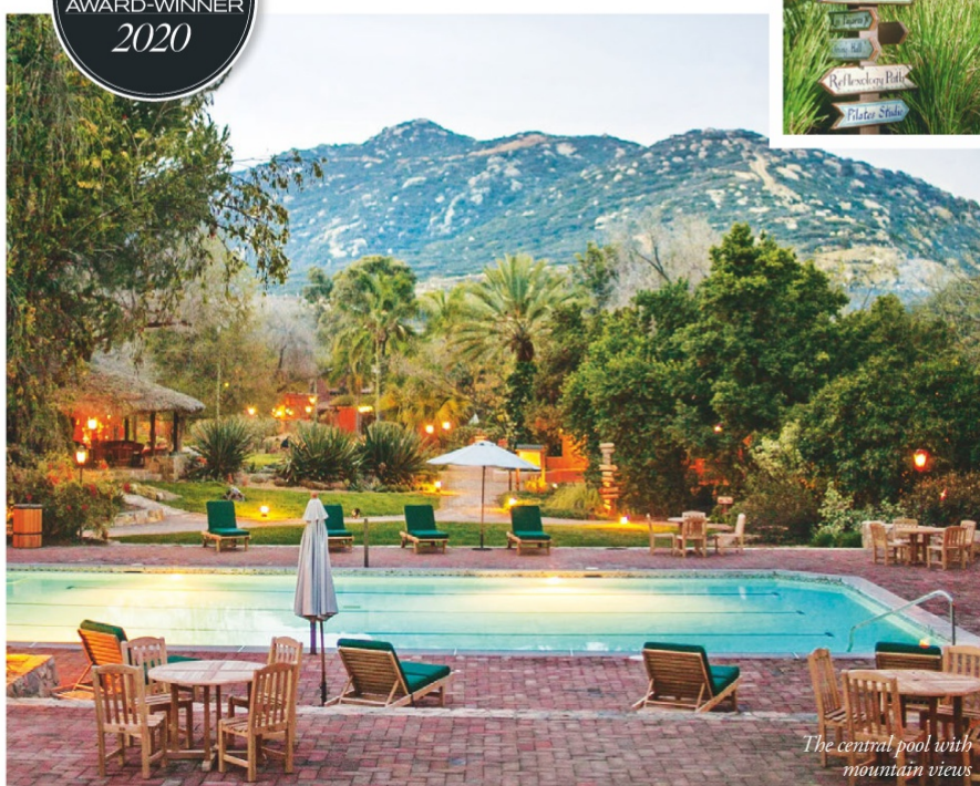
The central pool with mountain views