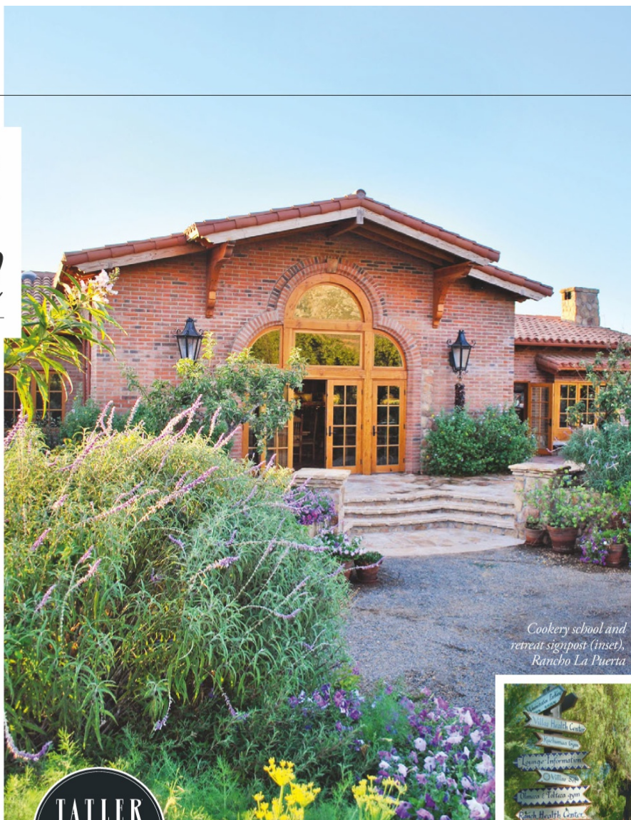
Cookery school and retreat signpost (inset), Rancho La Puerta