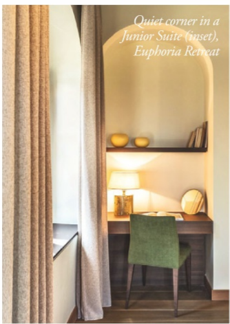
Quiet corner in a Junior Suite (inset), Euphoria Retreat